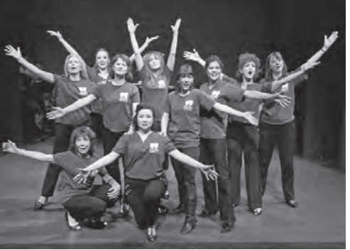
Cast members from NY's Women's History Month celebration.