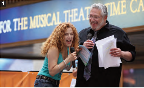
1 Broadway served as special pet escorts for the afternoon. Bebe Neuwirth, a proud parent of three cats, introduced the audience to a tiny black-and-white kitten adorned in red ribbon collar and representing seven cat rescue groups.

Tables from 27 New York area shelters lined Shubert Alley with adorable, adoptable pets as more than 50 actors currently appearing on