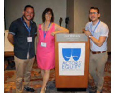
#EQUITYSTRONG Meet the Trailblazers of Equity