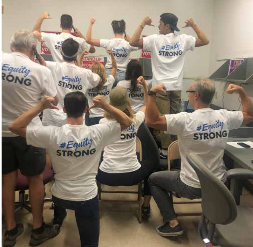
Equity members in the Muny production of Gypsy who phonebanked against Proposition A proved that they had the unions' back.

What both Almeida and Schurman circled back to is that the key to a union's success is internal solidarity. "It is the only source of power and influence that workers have," Schurman maintains. Unions are built through the active participation of their members, who participate in advocacy at grassroots and national levels. "There is a strong need to collectively organize and have your voice heard," Almeida advised. "Unions are the only counterbalance to strong powers like corporate interests and well-to-do billionaires. They feel threatened by unions having a voice in workplace and society. Unions are the only counterbalance."